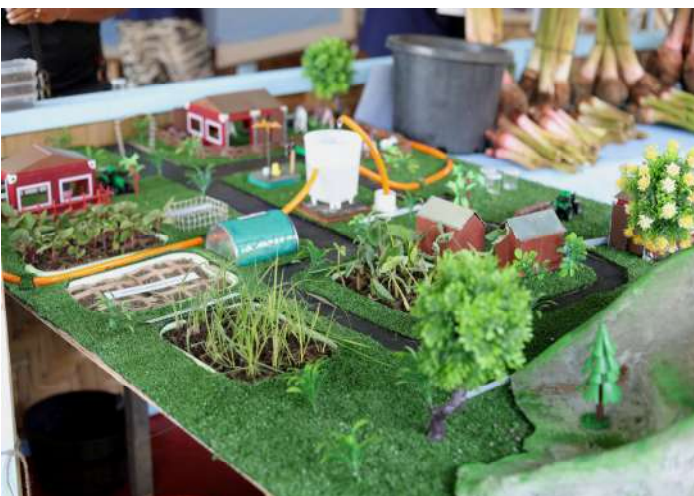
Sustainable Agriculture Farming, one of the main display highlights at the NARI stall.