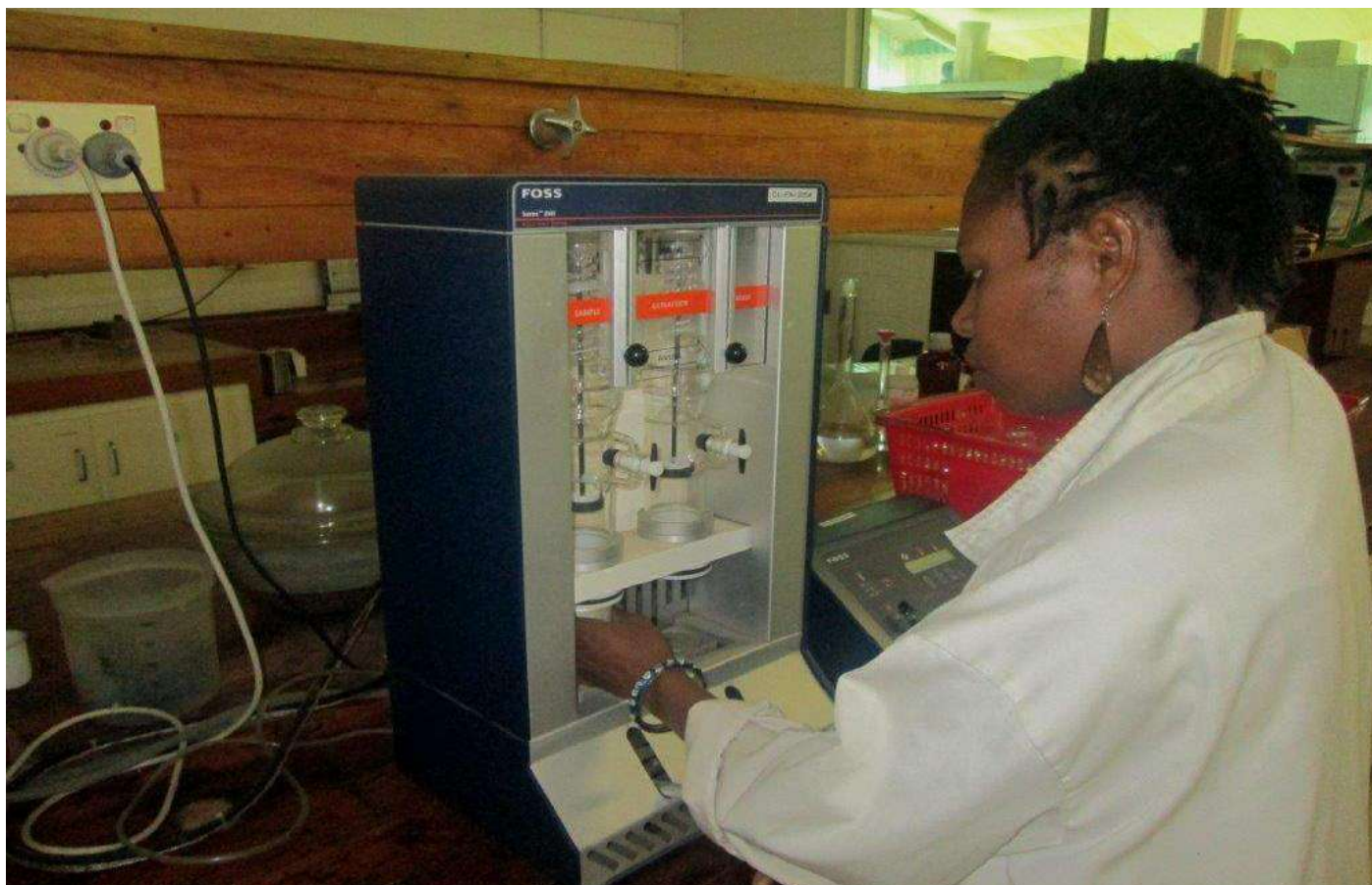
Quality Control Chemist, carrying out food testing on the Fat extraction equipment