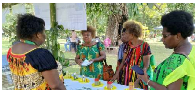
Female participants at one of the spice exhibitions.

The launching of a front loader tractor and other farm machinery was officially launched by Mr Ilam and other official guests from Coconut Products Ltd, and UNRE Kairak Estate. Other displays to compliment the World Food Day and Field day comprised of galip tree production and processing, spices and product diversification, livestock feed