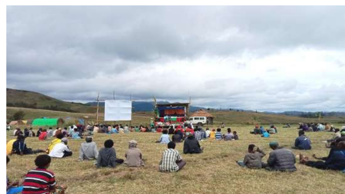
Camp participants listening attentively before the seed planting materials were distributed.