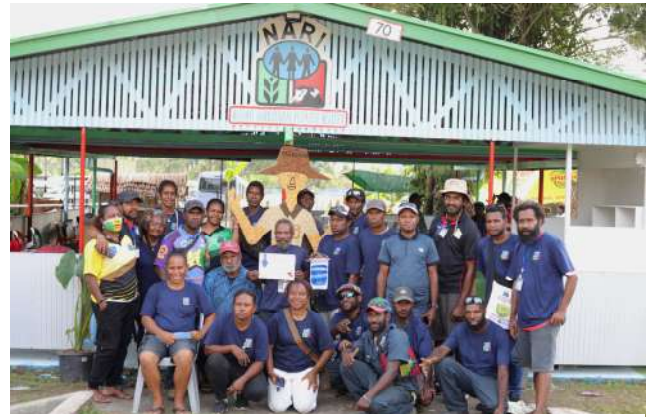
Team NARI including Wantok Produce Ltd displaying the winning certificate

NARI is looking forward to participation in the next Morobe Agricultural Show to showcase various displays from crops, livestock, farm machinery and relevant information to the farming community and nation as a whole.