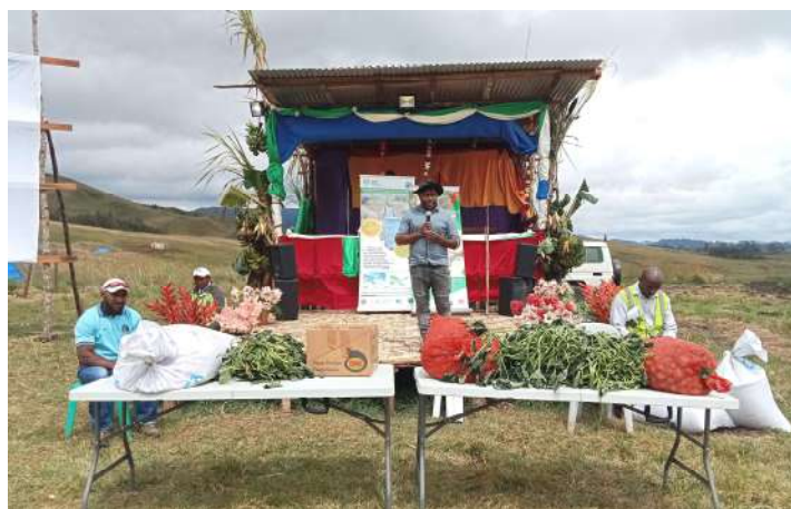
Part of the seed planting materials displayed by staff from Aiyura, Eastern Highlands.

The response from over 1,000 members of the Tairora community was overwhelmingly positive and welcomed innovative techniques that can revolutionize their farming practices in light of irregular weather patterns and limited access to