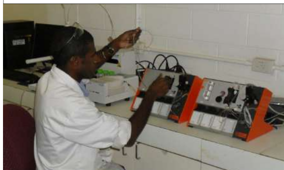
Aquatek Analyser for measuring Ammonium in water